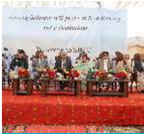
White Coat Ceremony