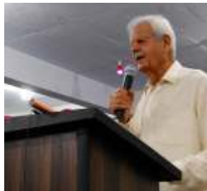
Road Safety Training