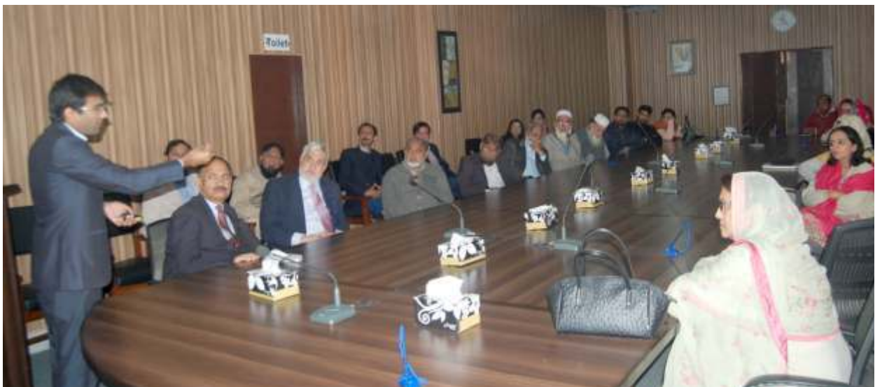
Workshop by Department of Medical and Dental Education on Small Group Teaching