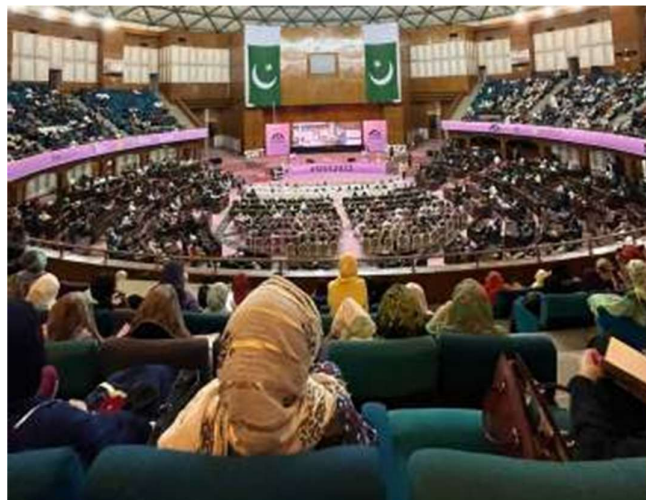
SIST 2022 at Shifa Tameer-e-Millat University Islamabad