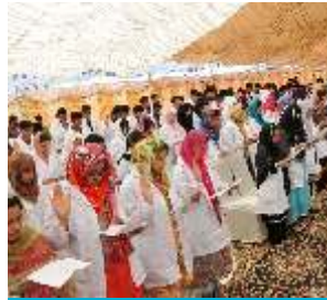
White Coat Ceremony