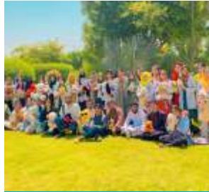
Color Day Special