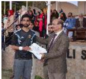
Cricket match at CMH