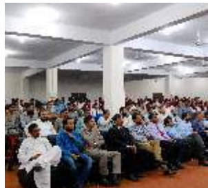
Road Safety Training