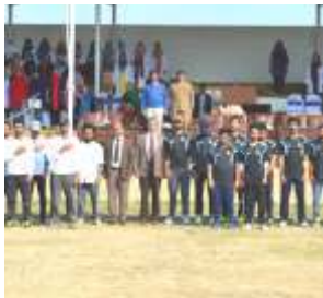
Cricket match at CMH