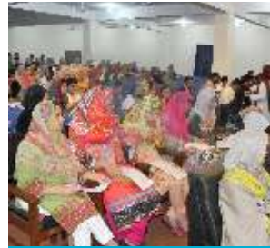
White Coat Ceremony