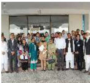
Inspection for FCPS training